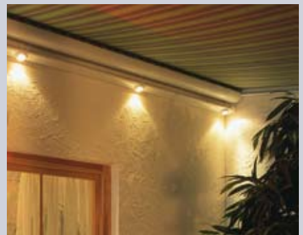
Version Sottezza Lux