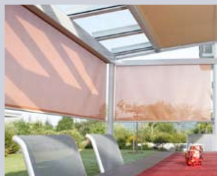
VertiTex vertical awning