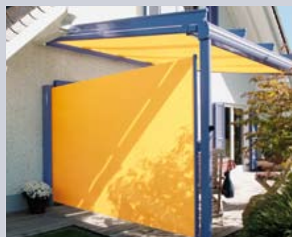
Paravento side screen