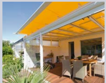
Fitted WGM sun room awning